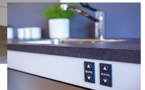
Easily controlled by an integrated press pad.