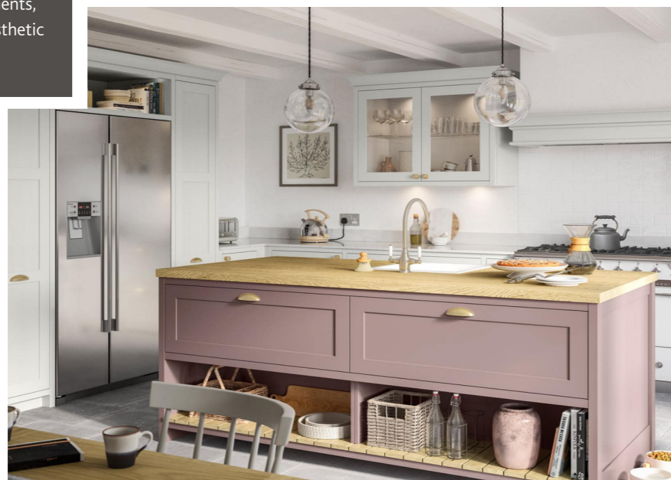
Main image: Range: Clifden Colour: Heritage Green & Porcelain Finish: Painted

Clifden is adaptable and can be tailored to your preferences and requirements, seamlessly infusing a modern aesthetic into a fully customised kitchen.