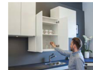
Electric vertical height adjustment