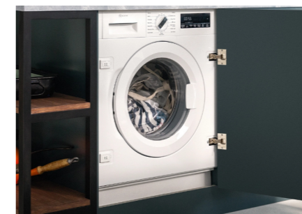
Washers & Dryers