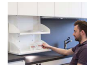
Electric height-adjustable shelves