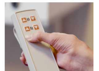
Remote operation for ease of use